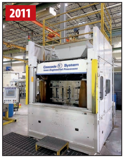
IOWA ENGINEERED PROCESSES CASCADE 1600 DEBURRING SYSTEM