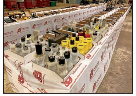
HUGE SELECTION OF TOOLING

(500+) CAT 50 TOOL HOLDERS, RENISHAW PROBES, LIVE TOOLING, CARBIDE INSERTS, CAPTO TOOLING, KM TOOLING, DRILLS, END MILLS, CARBIDE TIPPED END MILLS, FACE MILLS, CHAMFER TOOLS, TAPS, AND MORE