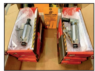
LARGE SELECTION OF PNEUMATIC TOOLS