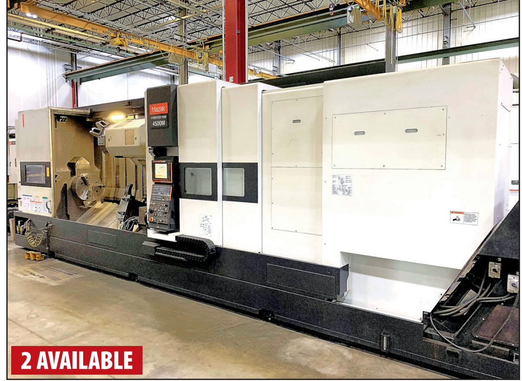
MAZAK CYBERTECH 4500M CNC TURNING CENTER

Sale Date: Thursday, March 28 at 10:00 AM CT Inspection: Wednesday, March 27 from 8:00 AM-4:00 PM CT or by Special ppointment