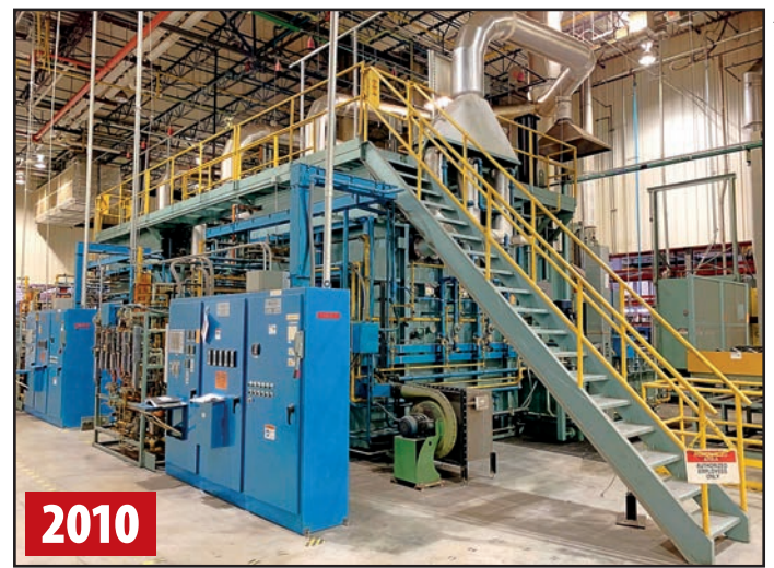
AFC HOLCROFT IQ (INTERNAL QUENCH) HEAT TREAT SYSTEM