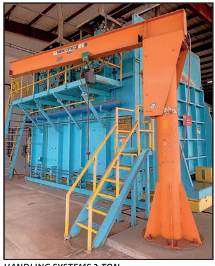
HANDLING SYSTEMS 2-TON FREE STANDING JIB CRANE

FLAMMABLE LIQUIDS CABINETS, FOREMAN'S DESKS, STEEL SAW HORSES, SHOP CARTS, FLATBED CARTS, SCISSOR LIFT TABLES, LIFT AND TILT TABLES, PALLET WRAPPING MACHINE AND MUCH MORE