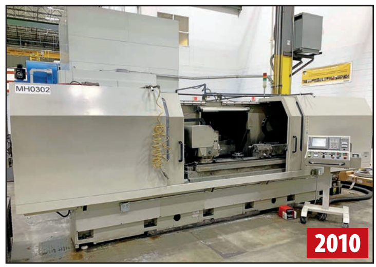
OKAMOTO OGS 12-60 UNIVERSAL IO/OD GRINDER