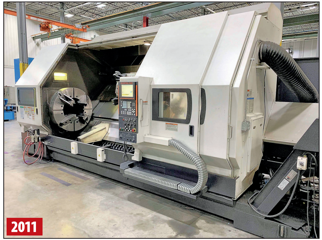
MAZAK ST80N CNC TURNING CENTER