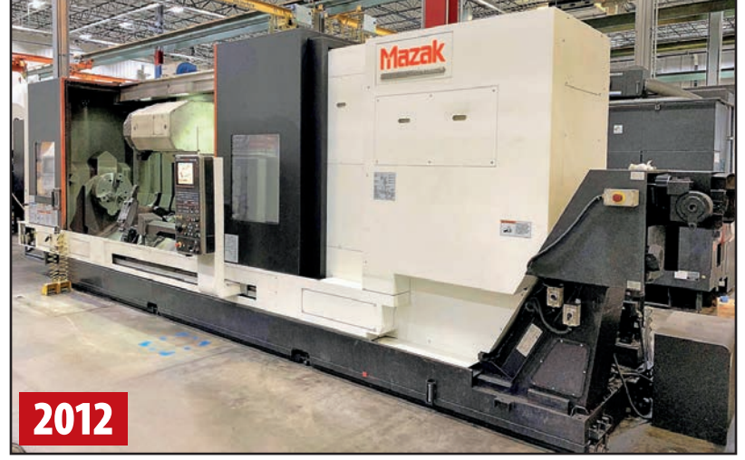
MAZAK CYBERTECH 4500M CNC TURNING CENTER

Sale Date: Thursday, March 28 at 10:00 AM CT