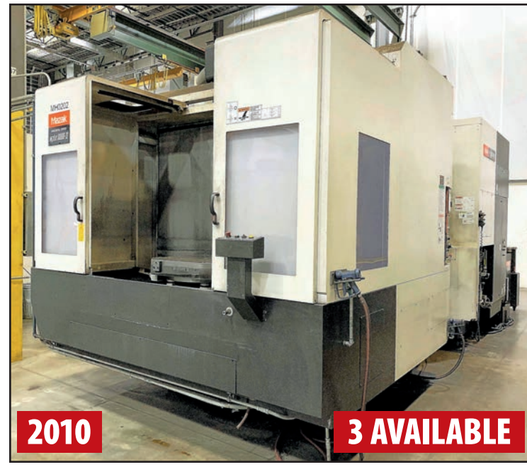
MAZAK NEXUS 8800-II CNC HORIZONTAL MACHINING CENTER