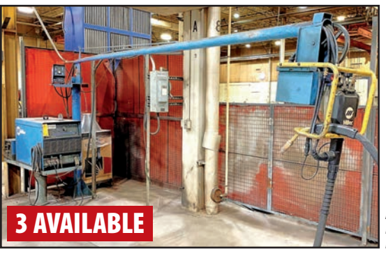
DELTAWELD 652 POWER SOURCES

WILLIAMS CAR BOTTOM STRESS RELIEF FURNACE, s/n 02710, 1,250 Deg. F Max. Temp, Natural Gas, 102"W x 19"D x 102"H Capacity, (2) Zones, Car Equipped, Brick Lined Car, Fiber Lined Furnace