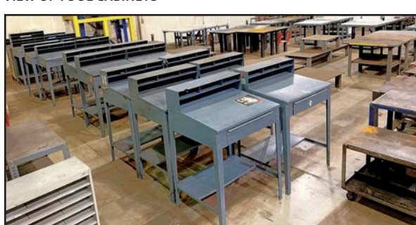
VIEW OF FOREMAN'S DESKS AND STEEL TABLES