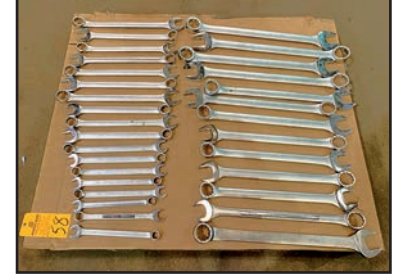
LARGE SELECTION OF HAND TOOLS