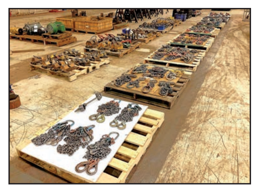
SELECTION OF RIGGING CHAINS, STRAPS, CLEVISES AND MORE