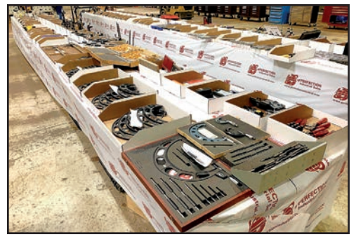
VIEW OF INSPECTION ITEMS