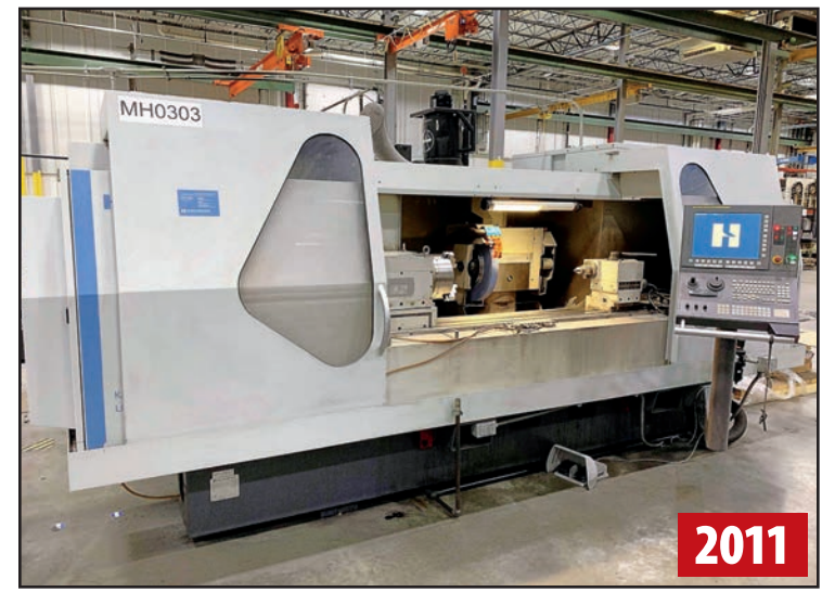
KELLENBERGER UR250/1500 UNIVERSAL IO/OD GRINDER