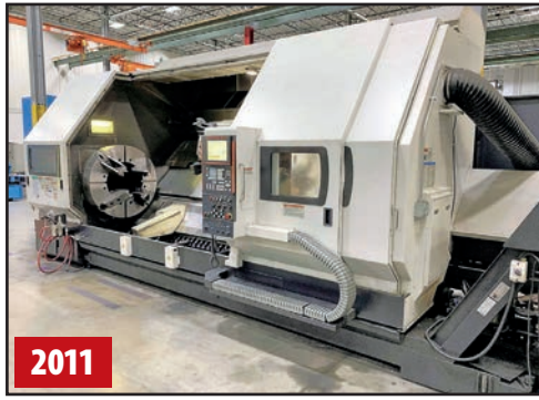
MAZAK ST80 CNC TURNING CENTER

Featuring: Late Model Mazak CNC Turning Centers & Machining Centers, CNC Vertical Grinders & Cylindrical Grinders, Deburring System, Heat Treat, Welding Department, Tooling, Inspection, MRO & Plant Support