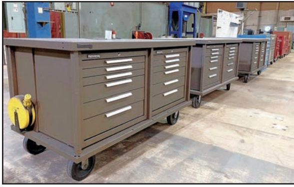
VIEW OF TOOL CABINETS